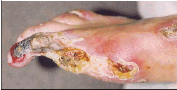
February 2, 2001: "... this is when the surgeon wanted to amputate below the knee."