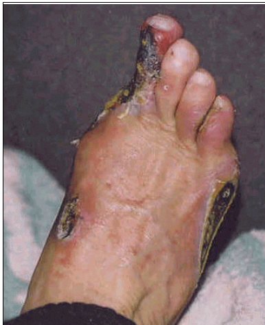
February 2, 2001